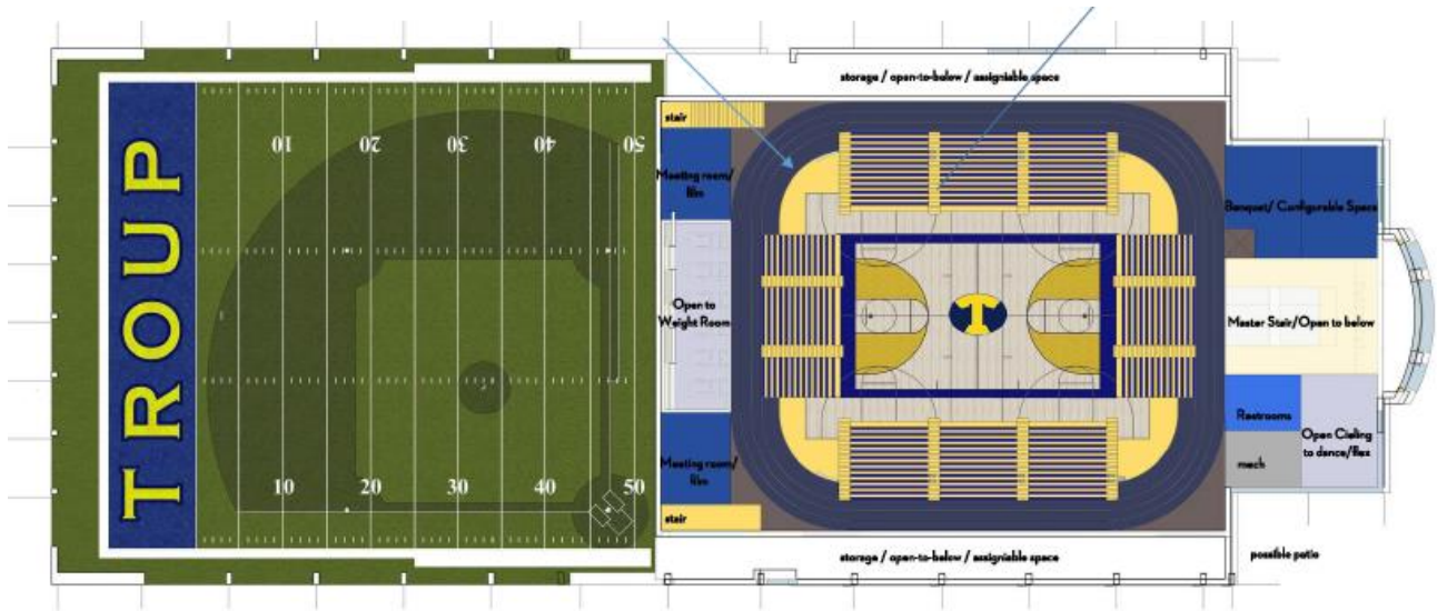
Concept Lower Level