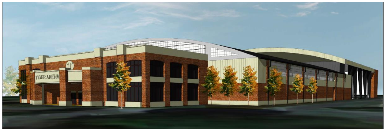
Concept Front Elevation Perspective