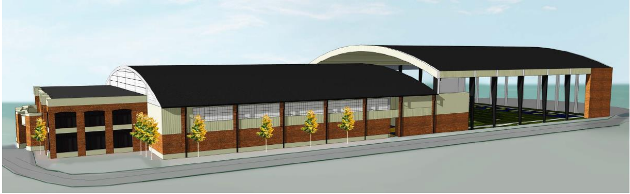
Concept Side Elevation Perspective