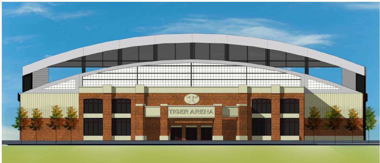
Concept Front Elevation