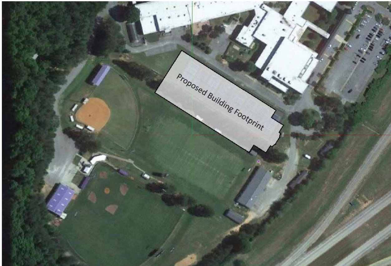
Concept Site Plan at Troup County High School